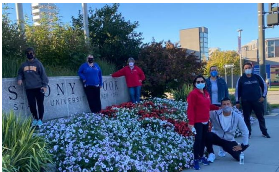
Figure 2. PPH Participates in Heart Walk

From September 3 to October 3, PPH faculty, staff students and alumni participated in the American Heart Association Virtual Heart Walk. The team, Prancing Pumping Hearts, participated virtually and held a few socially distanced walks together. The team logged over six million steps during the challenge.