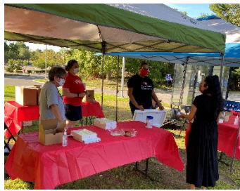
Figure 1. PPH Staff with Student at ID Badge Pick Up Event