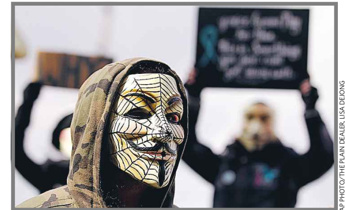
Anonymous protesters outside the Jefferson County Justice Center and Jail in Steubenville, Ohio, last week.

But many of the activists who championed the victim in the online media have engaged in their own problematic conduct, which the verdict does not justify. Though they exposed real problems, they also circulated unsubstantiated claims about the victim being deliberately set up for gang rape, and about